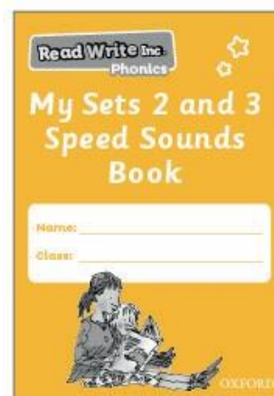
Practise reading and writing sounds in My Sets 2 and 3 Speed Sounds Book .

Ask your child to flick through the book and read the sounds as quickly as he or she can. If your child hesitates reading a sound, the picture is on the back as a reminder. Your child can also practise writing the sound on the same page.