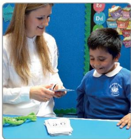
Learning the Speed Sounds in the classroom.